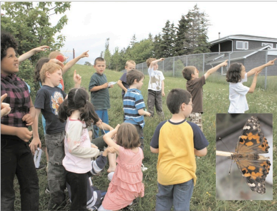
Grade One students from Baddeck Academy point to the last Painted Lady butterfly (inset) they released during their last week of school. The students raised the butterflies in their class room feeding them sugar water until they were strong enough to fly away on their own.