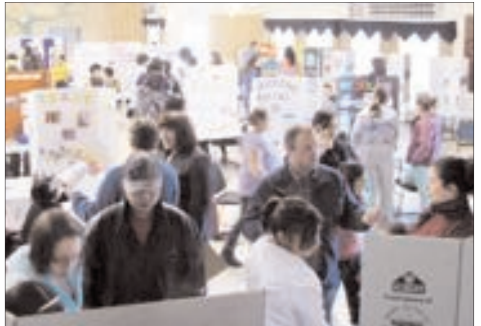
Participants are pictures at the Mi'kmaq Regional Science Fair which was held at the Wagmatcook Culture and Heritage Centre recently. Students from Wagmatcookway We'koqma'q, Membertou and Eskasoni schools competed for the opportunity to represent the region at the the Nova Scotia Showcase of Regional Winners to be hosted by St. Mary's University, and the Canada Wide Science Fair in Peterborough, Ontario.