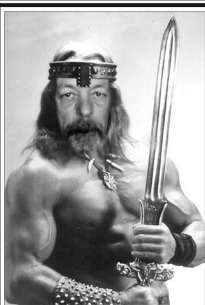
Guess who will be 60 on May 25th? BOY, HE LOOKS GOOD!